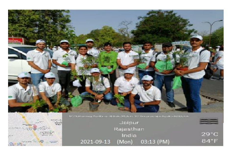
Picture 6 – Plant Distribution on World Ozone Day at Central Park, Jaipur