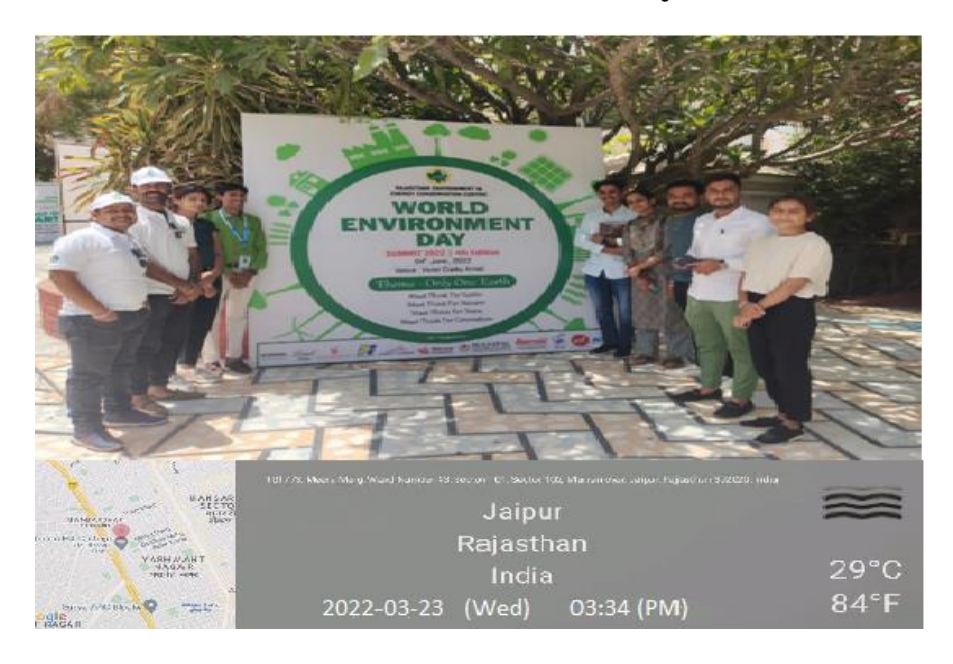
Picture 3 - World Environment Day celebration at Jawahar Circle Jaipur