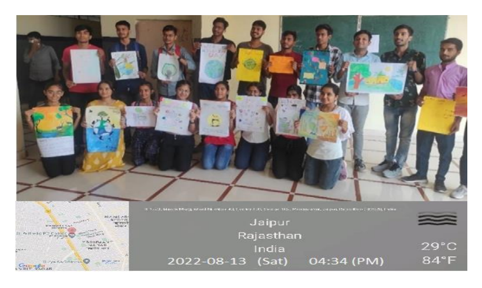
Picture 4 – Poster Making Competition on World Environment Day at Jawahar Circle Jaipur