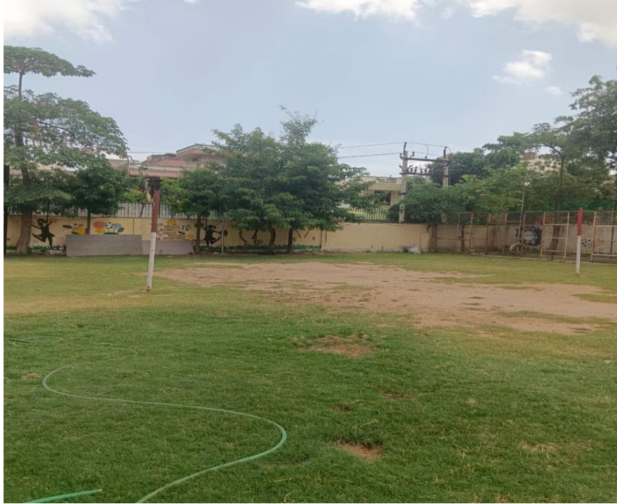
Outer View of the College

(Affiliated to the University of Rajasthan)