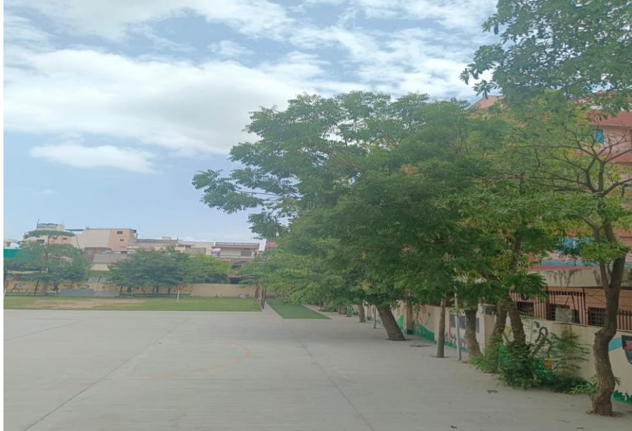
Landscaping Trees and Plants in College Campus

Snapshots Depicting Specific Facilities for Green Campus Initiatives