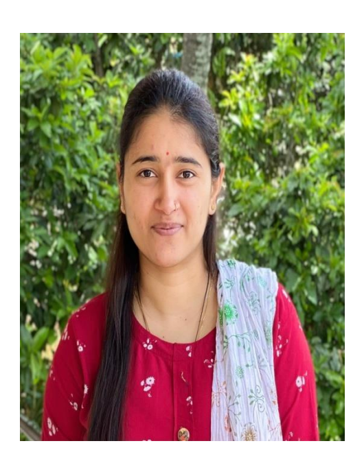
SarlaMundel UGC NET COMMERCE