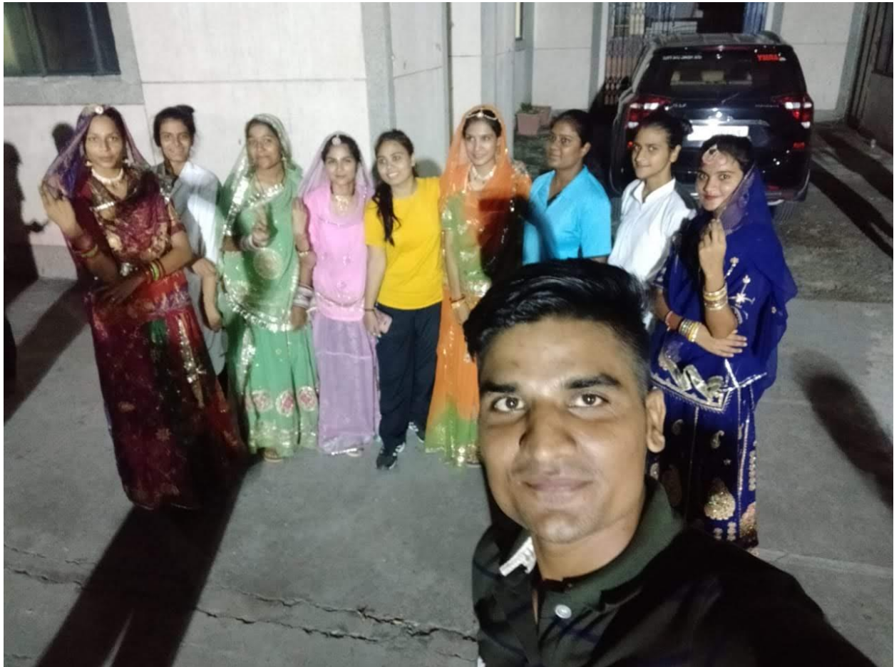
Group photo after successful camp

(Affiliated to the University of Rajasthan)